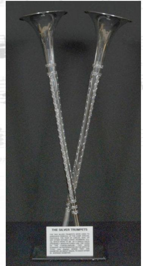
THE SILVER TRUMPETS THE TWO SILVER TRUMPETS WERE USED TO ANNOUNCE THE START OF THE YEAR OF JUBILEE, AND TO CALL THE PEOPLE TO ASSEMBLE AT THE TABERNACLE. THEY WERE MADE OF PURE SILVER AND WERE USED TO ANNOUNCE THE START OF THE YEAR OF JUBILEE, AND TO CALL THE PEOPLE TO ASSEMBLE AT THE TABERNACLE. THEY WERE MADE OF PURE SILVER AND WERE USED TO ANNOUNCE THE START OF THE YEAR OF JUBILEE, AND TO CALL THE PEOPLE TO ASSEMBLE AT THE TABERNACLE.